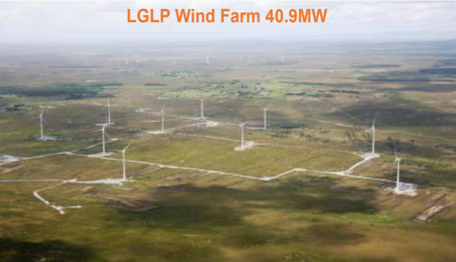
LGLP Wind Farm 40.9MW

Ireland imported 66% of its energy requirement in 2017, one of the highest ratios in Europe. The more of its own energy Ireland can produce, the less vulnerable it would be to foreign policy and conflict interrupting gas, oil and electricity supply lines. There is an opportunity to continue developing a strong indigenous wind industry, that will take advantage of Ireland's excellent wind resource, reducing our import dependency.