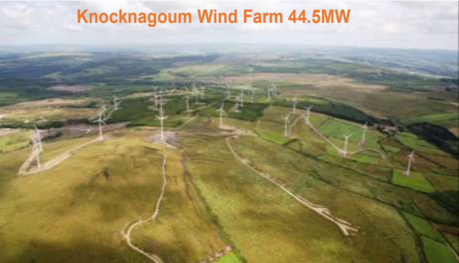
Knocknagoum Wind Farm 44.5MW